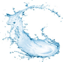
Sprinkle of Water